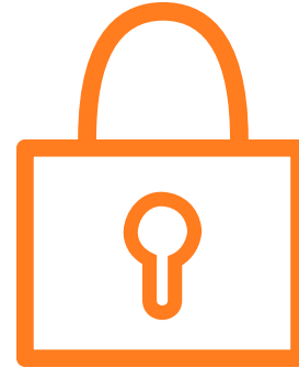
Secure move dates in Dec/Jan