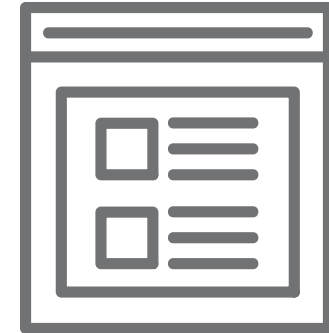
Move related comms