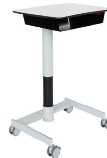
Teachers Sit-Stand Desk