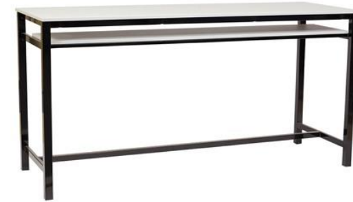
8 x Student Desks 1710W x 585D x 890H