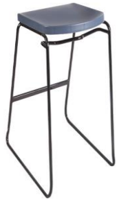
18 x Sebel Focus Stools 490W x 550D x 720H