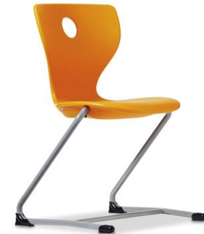
4 x PantoFlex Student Chairs