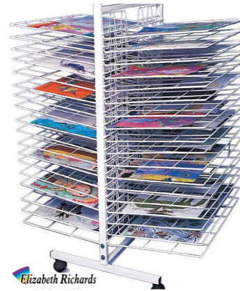
Large Drying Rack 36 huge drying trays (18 each side) Trays measure 68cm x 48cm (Approximately A2 paper size). Overall assembled dimensions 116cm (H) x 70cm (W) x 98cm (D)