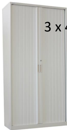
3 x 4.5LM

The combined wet area, features fixed joinery in the sink area of approx. 8LM & 3 x High Tambou cabinets.